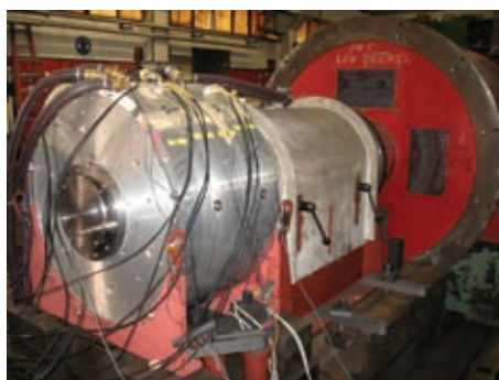
The first prototype of the new generator.