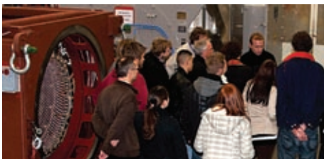
Night-time visitors at the LDW works.

About 100 visitors – many students among them – took advantage of Bremen’s first “Long Night of Industry” to get an impression of our work at LDW. The participants were particularly interested in the huge machine parts in our manufacturing area. A delayed work shift was scheduled to arrange for 40 employees to be on the job during the visiting hours. In the